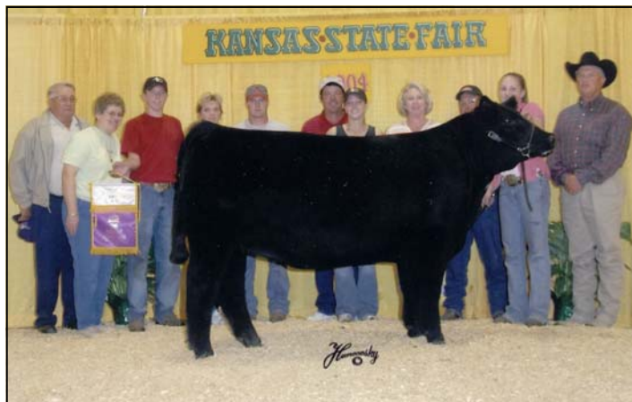
BSMA HEATHER 300N