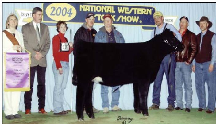
HAA COUNTESS 318N —Grand Champion Female, 2004 NWSS Denver Co. Sired by The Man. Just one of the 2003 heifers featured in the package of heifer calves purchased by Schmidt-Long.

they bring to the breed. We predict great things from this herd in the future.