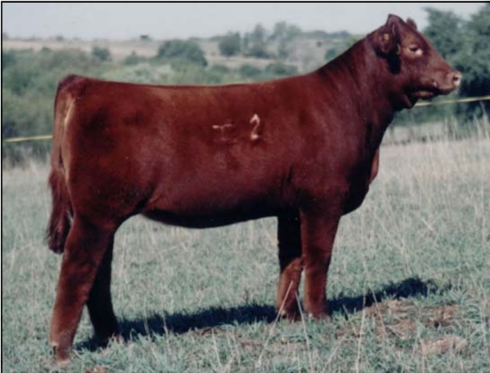
HALLS ENCHANTRESS 38M—The $100,000 female that topped the 2002 HCC Sale. She's a Limited Edition daughter out of Legacy Plus' dam. Proving her worth as a brood cow, the Enchantress Group have consigned her first calf, a powerful January 38J daughter as Lot 3 in the December Sale.