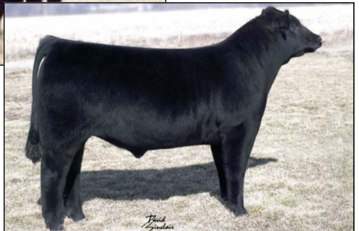
HAA NOBLEMAN 307N—Featured natural service sire on Larry Lind's bred heifers selling in the December Sale. He's the Polled Purebred son of The Man out of FJH Countess 408L that was the Lead Bull in the HCC Grand Champion Pen 2004 NWSS.

A bright future looms ahead for this splendid set of brood cow prospects.